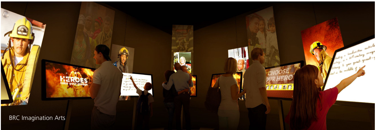
BRC Imagination Arts

a beacon on the landscape visible from a great distance along highway I-65.